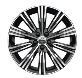
18" 10 Multi Spoke (std Inscription)