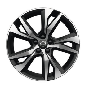
18" 5 Double Spoke (std R-Design)