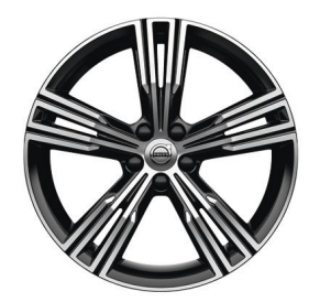
19" 5 Multi Spoke (#1041)