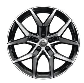
19" 5 Y Spoke (std Polestar Engineered)