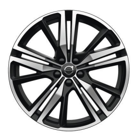
19" 5 Triple Spoke (#1042)